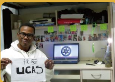
• I love UCAS