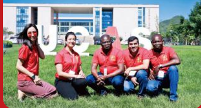
• Campus Activity