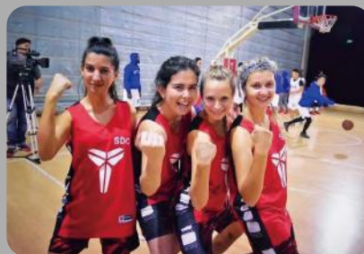
• Team Building