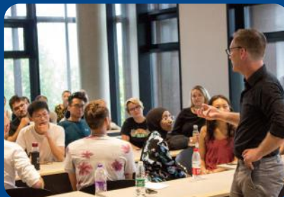
• On-class Teaching